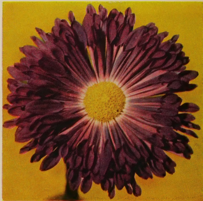
GARNET SPOON. 60c each; 3 for $1.50

7 Sterling Spoons Truly the very best in spoon varieties 7 Sure-to-Bloom Plants $3.50 (1 of each pictured)